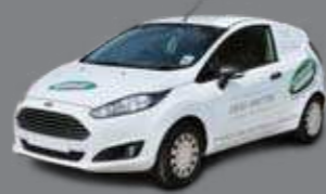
PAINTLESS DENT REMOVAL