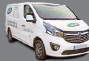
INTERIOR & GLASS REPAIR