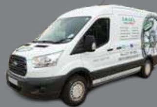
ALLOY WHEEL REFURBISHMENT