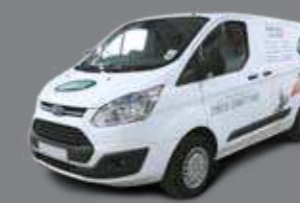
S.M.A.R.T REPAIR INSURANCE